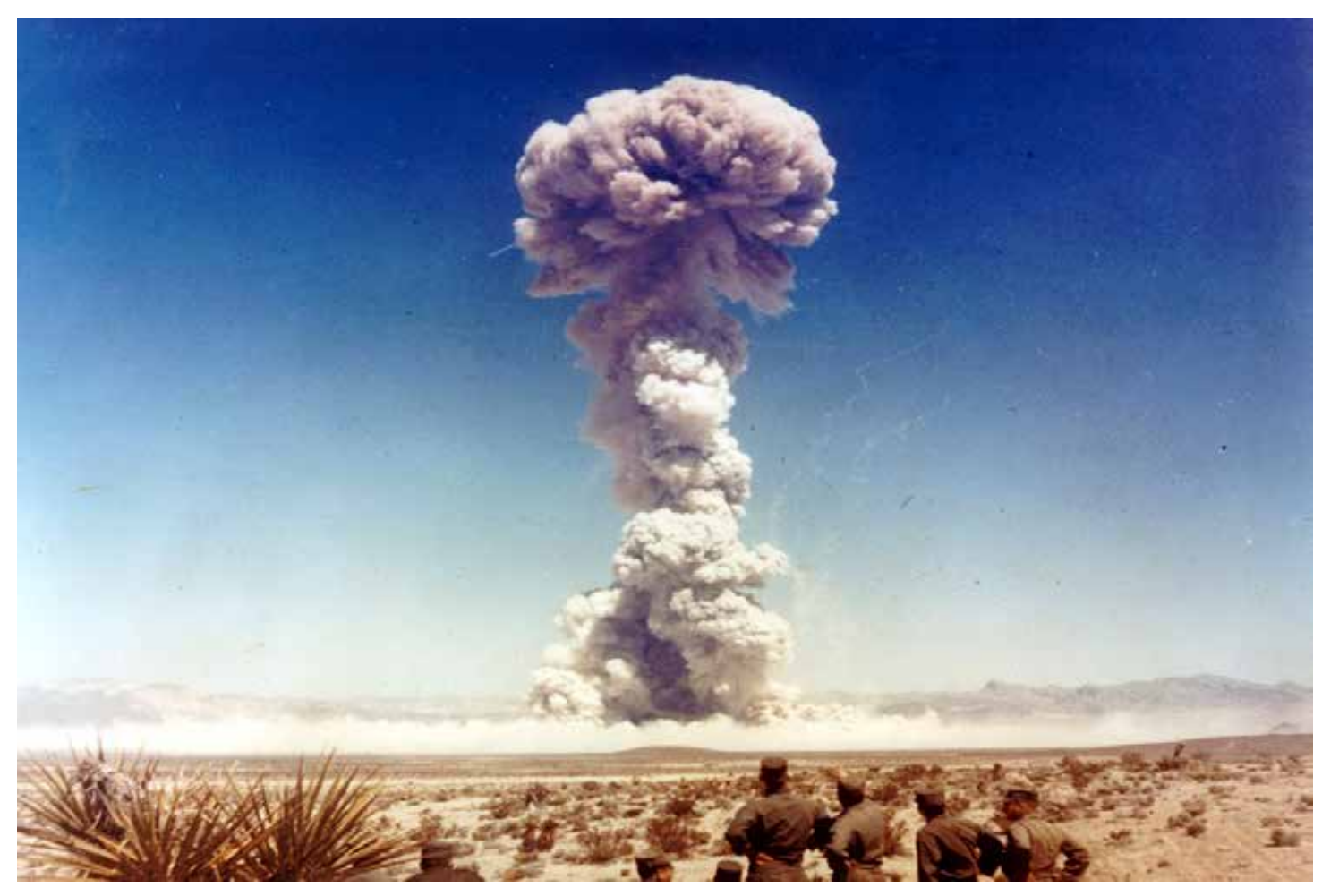
Military personnel observe a nuclear weapon test in Nevada, the United States, in 1951.

These "modernisation" programmes are not, as this study has shown since in its first edition in 2012, just about "increasing the safety and security" of nuclear arsenals, which is what the governments of these countries claim. The "upgrades" in many cases provide new capabilities to the weapon systems. They also extend the lives of these weapon systems beyond the middle of this century, ensuring that the arms race will continue indefinitely.