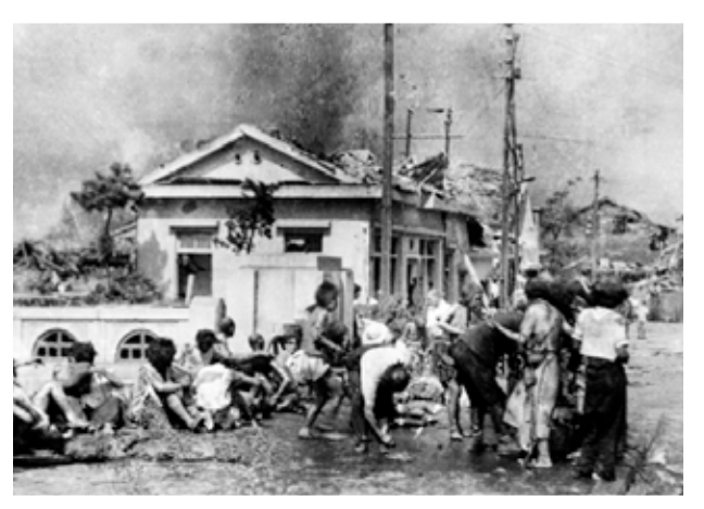
Injured civilians in Hiroshima, 6 August 1945